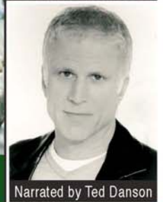
Narrated by Ted Danson